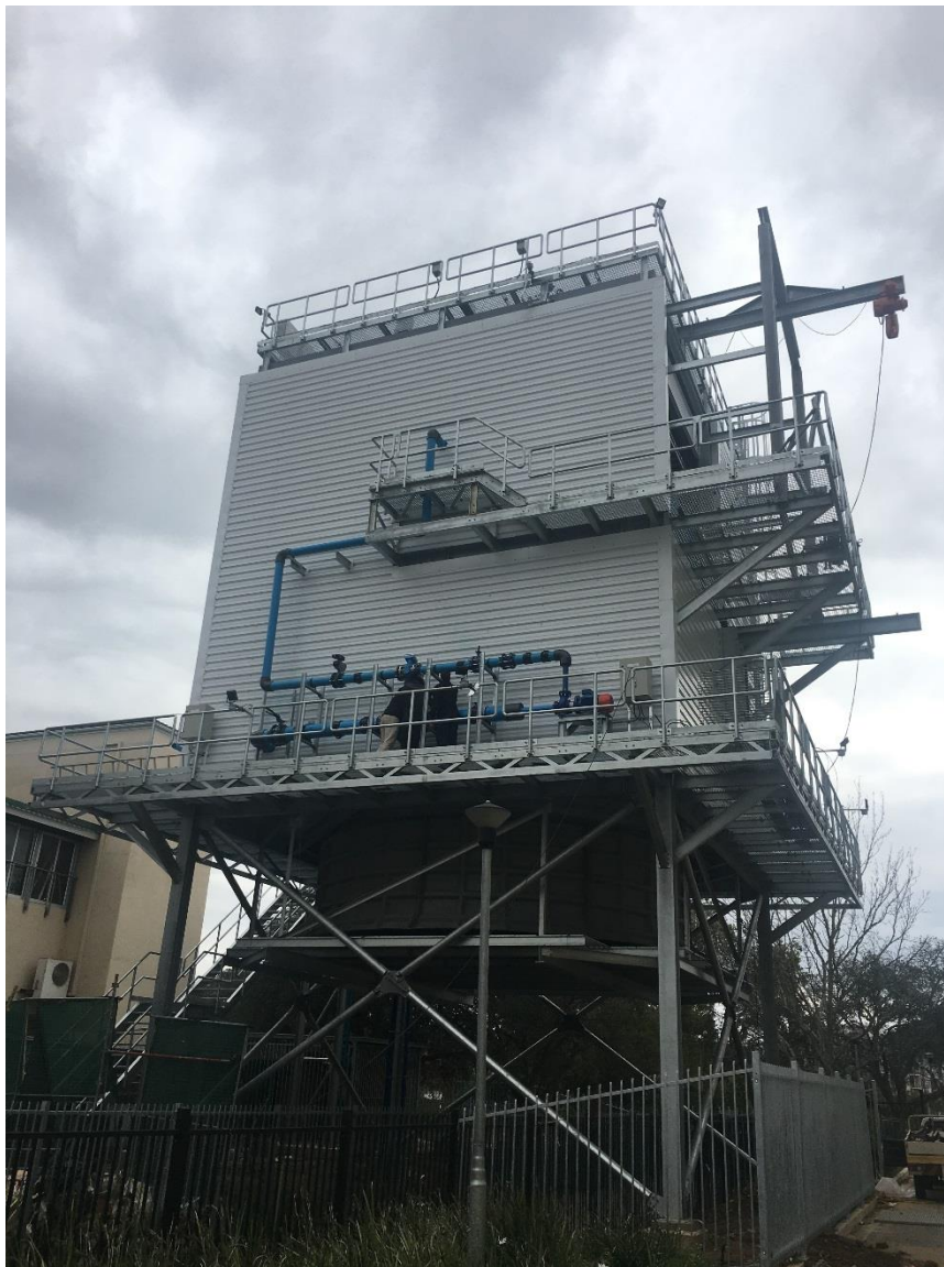
Figure 1.1: Full scale test facility (near completion)

The full-scale test facility (part of Deliverables 8.1 and 8.2) is constructed at Stellenbosch University, Stellenbosch, South Africa and depicted in figure 1.1. It serves as a test bench for the testing of full-scale (24 ft in diameter) fans as well as the novel deluge condenser system (developed extensively in Work package 2 of the present MinWaterCSP project).