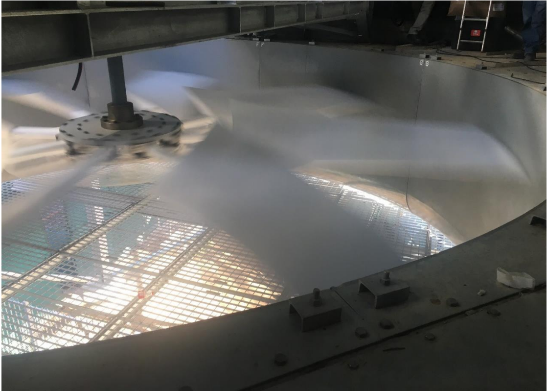
Figure 2.2: CSP fan operating at full speed (151 rpm)